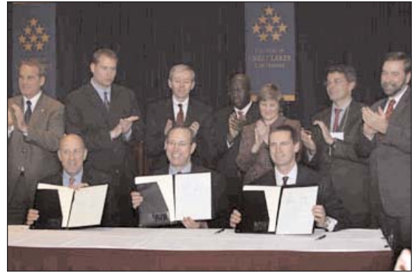
The Annex Implementing Agreements are signed.

Chair, Council of Great Lakes Governors Governor, State of Wisconsin