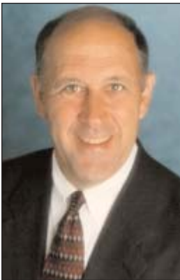
Wisconsin Governor Jim Doyle.

At the Council of Great Lakes Governors' Leadership Summit in Milwaukee on December 13, I was honored to accept the Chair's gavel from my Co-Chair, Ohio Governor Bob Taft. Governor Taft has left a tremendous legacy and, as Chair, I am eager to work with each of you to build on our recent successes.