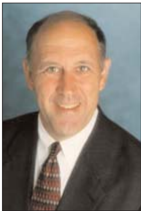
Wisconsin Governor Jim Doyle

the shores and watching sunsets will create memories that will last a lifetime. During the coming months, nearly every one of us will be reminded of our connection to our greatest natural resource.