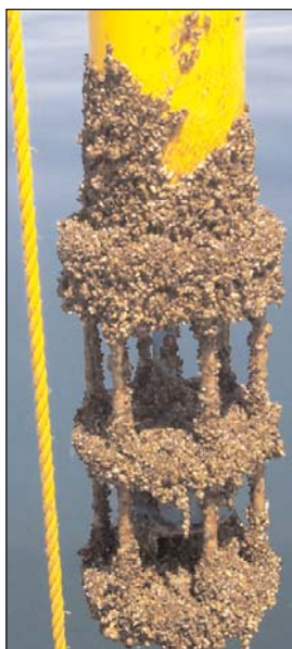
Zebra mussels wreak havoc in Lake Michigan.

board. These vessels contain a substantial volume of residual water and sediments that can