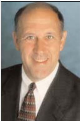
Wisconsin Governor Jim Doyle

As we enter the 2008 election cycle, it is time to assess each candidate and their priorities. If history is any guide, the Great Lakes States will be key in deciding next year's races. We should expect that anyone asking for our vote should have a serious plan to deal with one of our most important issues—restoring our nation's water belt, the Great Lakes.